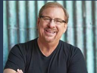
Pastor Rick Warren